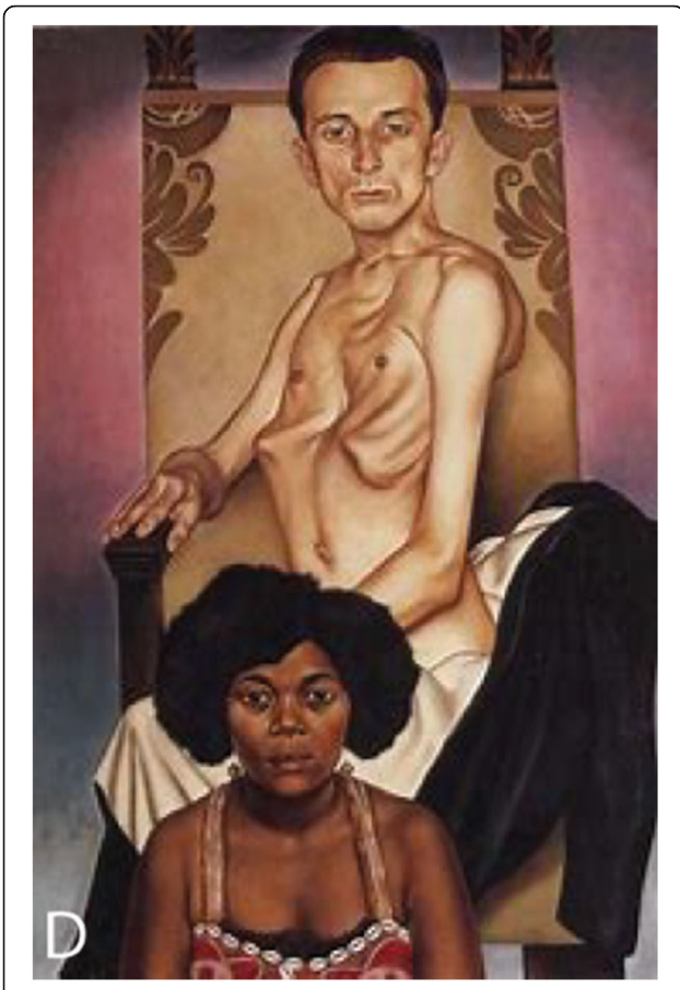
Fig. 4 Agosta der Flügelmensch und Rascha die schwarze Taube, 1929, painted by Christian Schad (1894–1982) [53]

Bocaccio, suggestive, according to the authors, of heart failure [55].