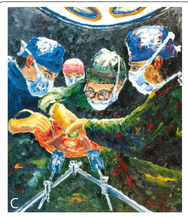
Fig. 3 The moment of truth [50]

In Mo the protagonist, who is born with clubbed feet, is diagnosed with Marfan's syndrome in his adolescence [52]. The movie tragically ends with a fatal aortic dissection or rupture in the protagonist, just 2 weeks before the scheduled aortic surgery. The appearance of the