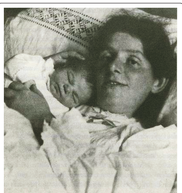
Figure 5 Paula Modersohn-Becker with her daughter Mathilde, November 1907. Paula Modersohn-Becker Stiftung, Bremen. Wikipedia: http://commons.wikimedia.org/wiki/File:Gc-paula.jpg.